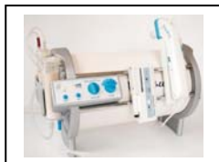
Ultrapeel® II plus microdermabrasion Connectivity