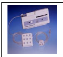
Individually Packaged Disposable Electrode Caps And Precision Liquid Dispenser